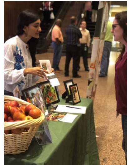
Tabling event held in the GPC lobby in October 2018.