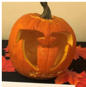
GP – Floor 7