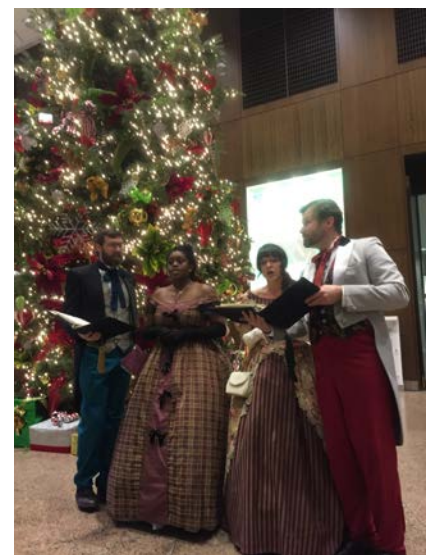
Carolers singing in the building lobby in 2015

Complimentary gift wrapping will be available to all GPC Tenants on December 11 and December 12. See Page 4 for details.