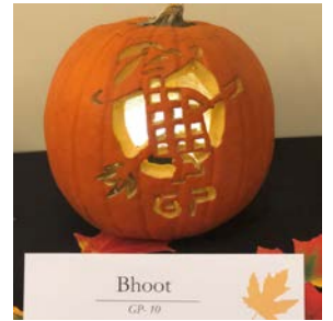
GP – Floor 10

All of the pumpkins entered in the contest were amazing. The participation was greatly appreciated. The contest was a great success and JLL is excited to see what tenants come up with next year.