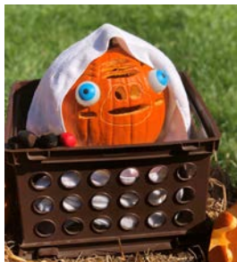
GP – Floor 8