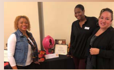
GP for Kids Best Precision