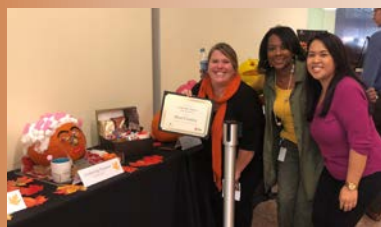
Leadership Atlanta Most Creative