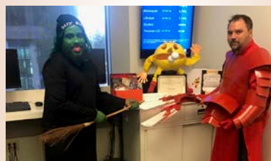
Georgia's Own Credit Union Funniest