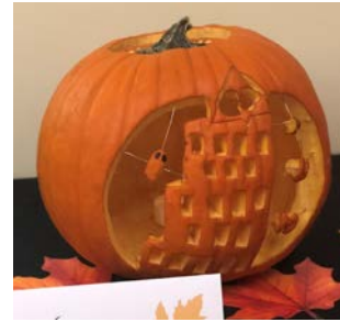
GP – Floor 6